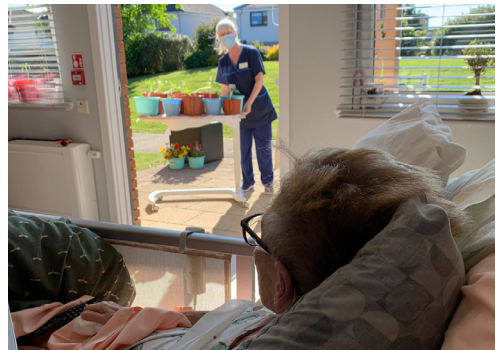
A patient enjoying the view from their bed

Thank you for supporting your local hospice